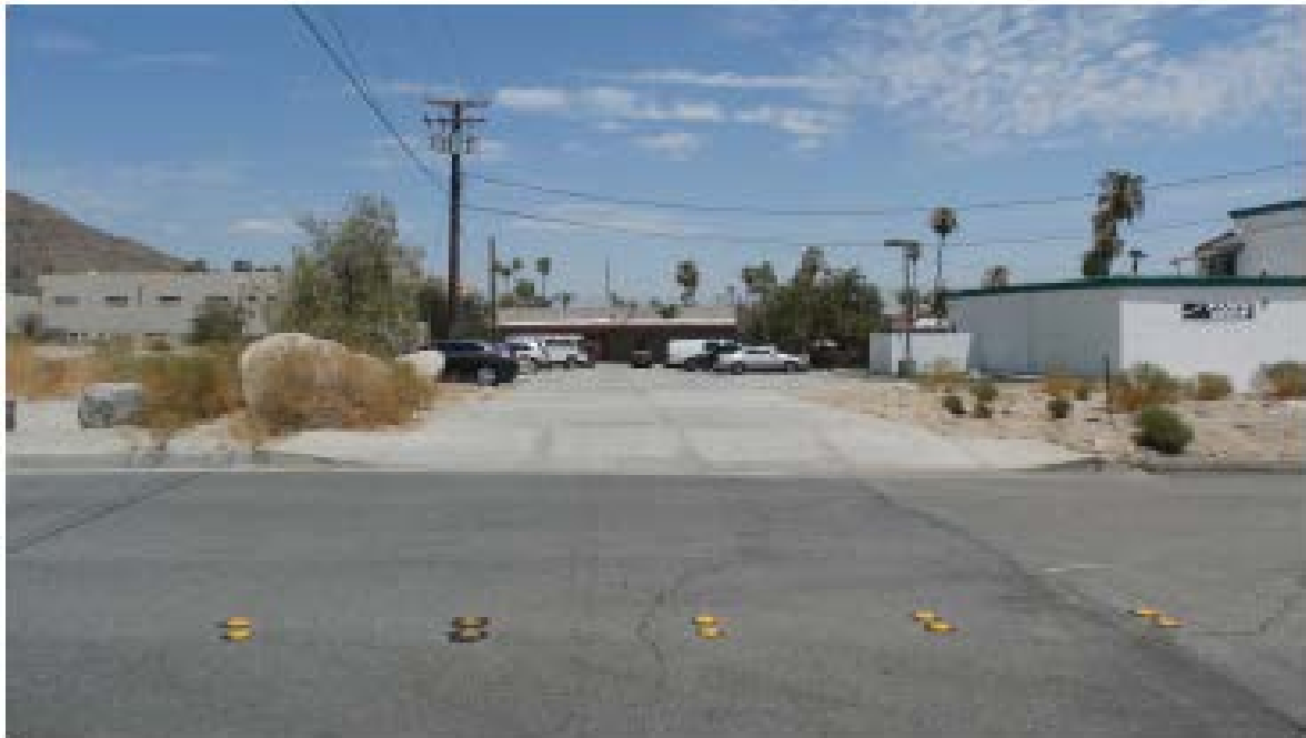
Looking north driveway that runs across subject property