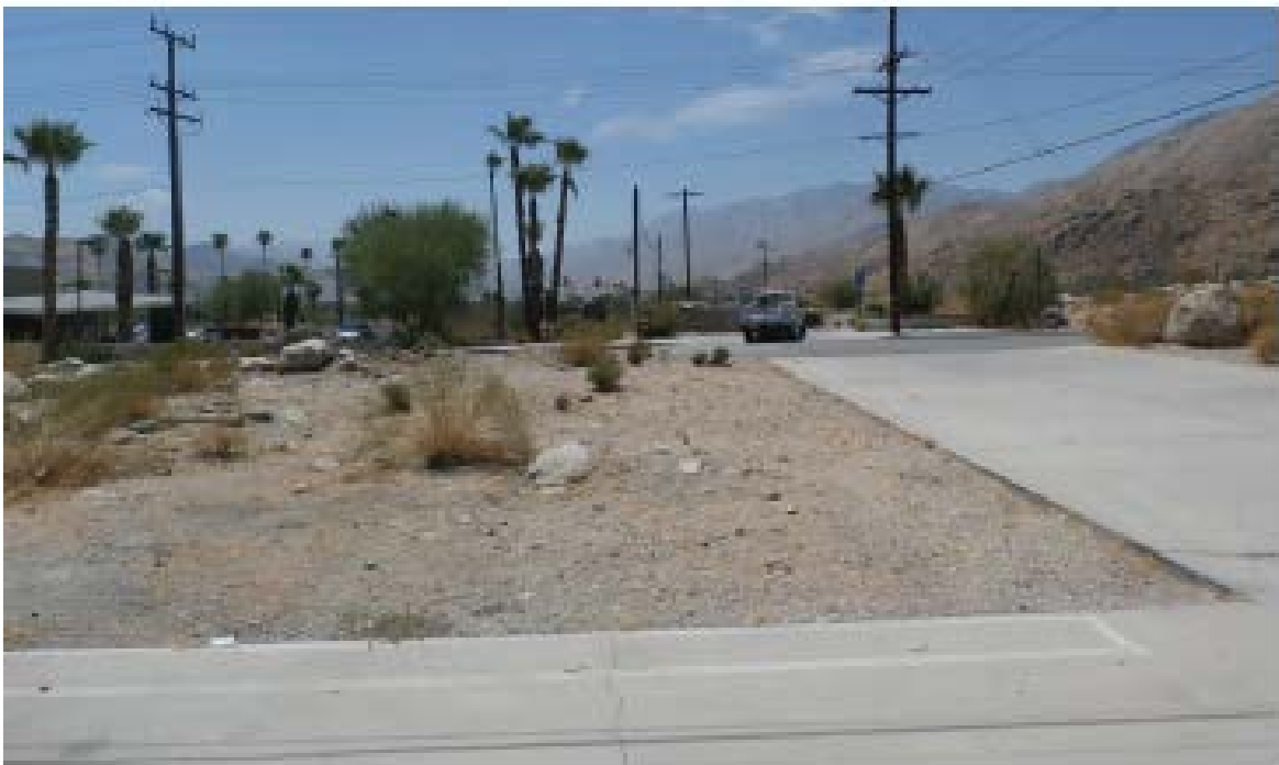
Looking south across subject property