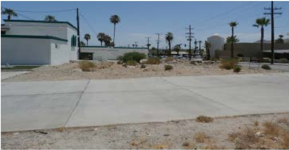
Looking east across subject property