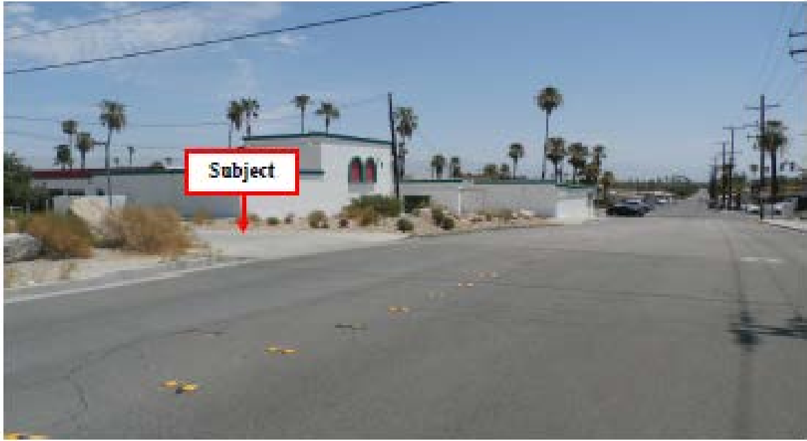
Looking east along Sunny Dunes Road