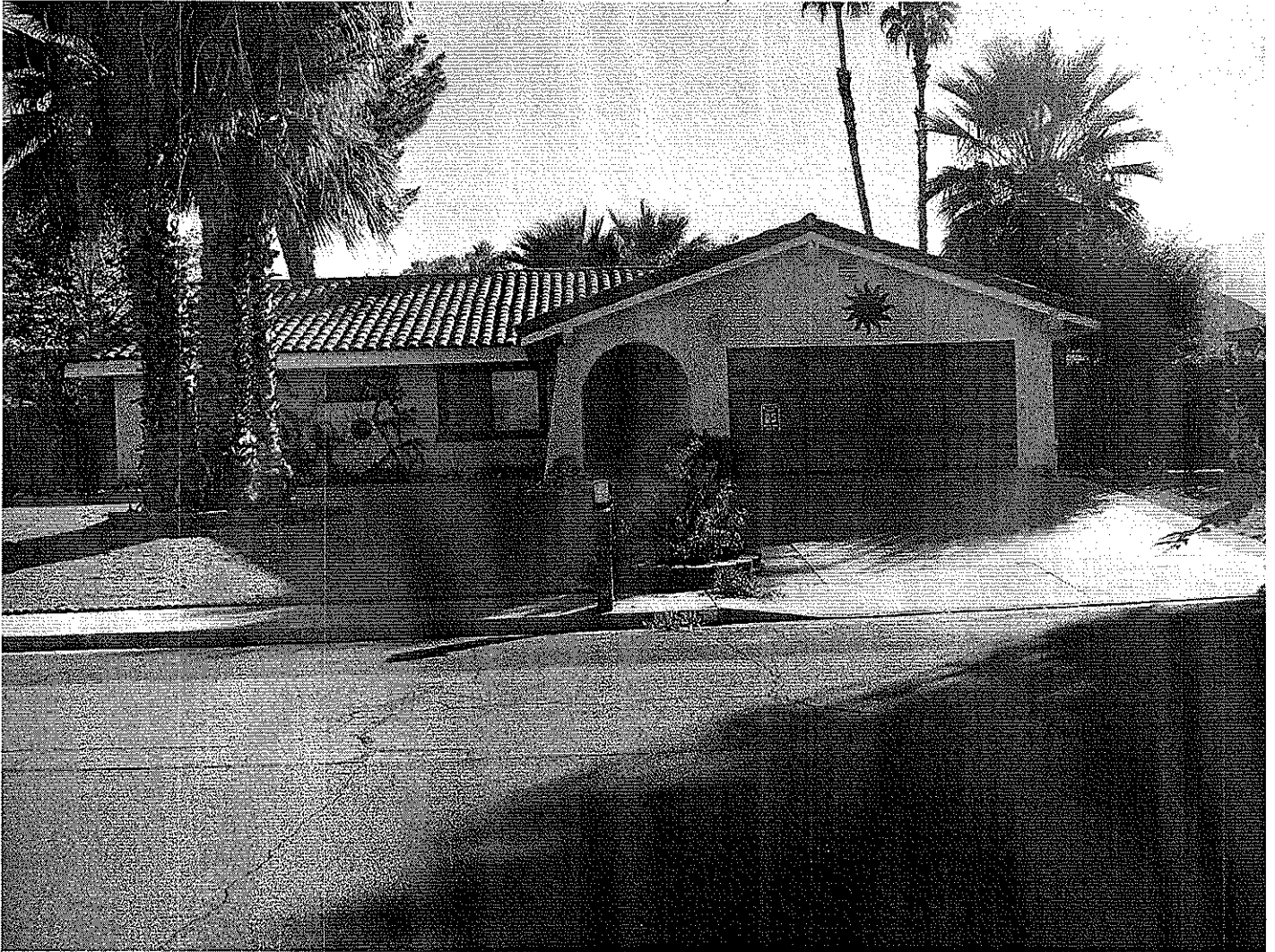
FRONT (VIEWING SOUTH)

If using the Elevation Certificate to obtain NFIP flood insurance, affix at least 2 building photographs below according to the instructions for Item A6. Identify all photographs with date taken; "Front View" and "Rear View"; and, if required, "Right Side View" and "Left Side View." When applicable, photographs must show the foundation with representative examples of the flood openings or vents, as indicated in Section A8. If submitting more photographs than will fit on this page, use the Continuation Page.