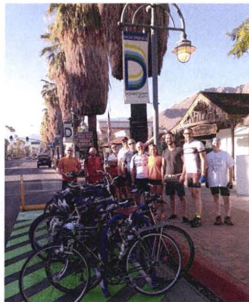
Figure 2: One of six bicycle corrals used to park up to 12 bicycles. Project was funded by MSRC grant.

Addition of the bicycle corrals provides safer parking options for cyclists. Adding bicycle parking encourages alternative transportation, and helps reach the City's goal of reduced greenhouse gas emissions. In addition, education and outreach has increased with the creation of new programs and materials promoting "open streets" events,