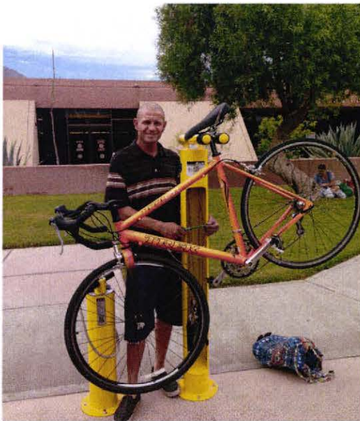
Figure 1: Bicycle Fix-it station at the City of Palm Springs Public Library. The project was funded by MSRC grant.

Many improvements have been made to bicycle lanes and other infrastructure such as bicycle parking facilities, including bicycle corrals and racks. A new bicycle rack hosting program was established in 2014 and resulted in the addition of over 60 racks at businesses and parks throughout the City, including in the three bicycle friendly business districts. In addition, the City now has three fix-it stations and six bicycle corrals in both private and public locations. Examples of these bicycle facilities supporting the City's NMTP are provided in Figures 1 and 2 below.