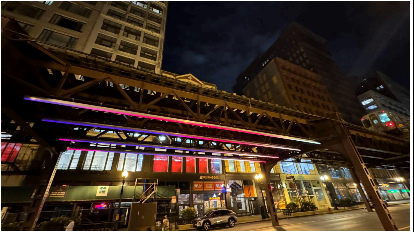
"The Wabash Lights" Aluminum, Polycarb, LEDs, 24'x20'x8" $145,000 July 2024 Chicago, IL