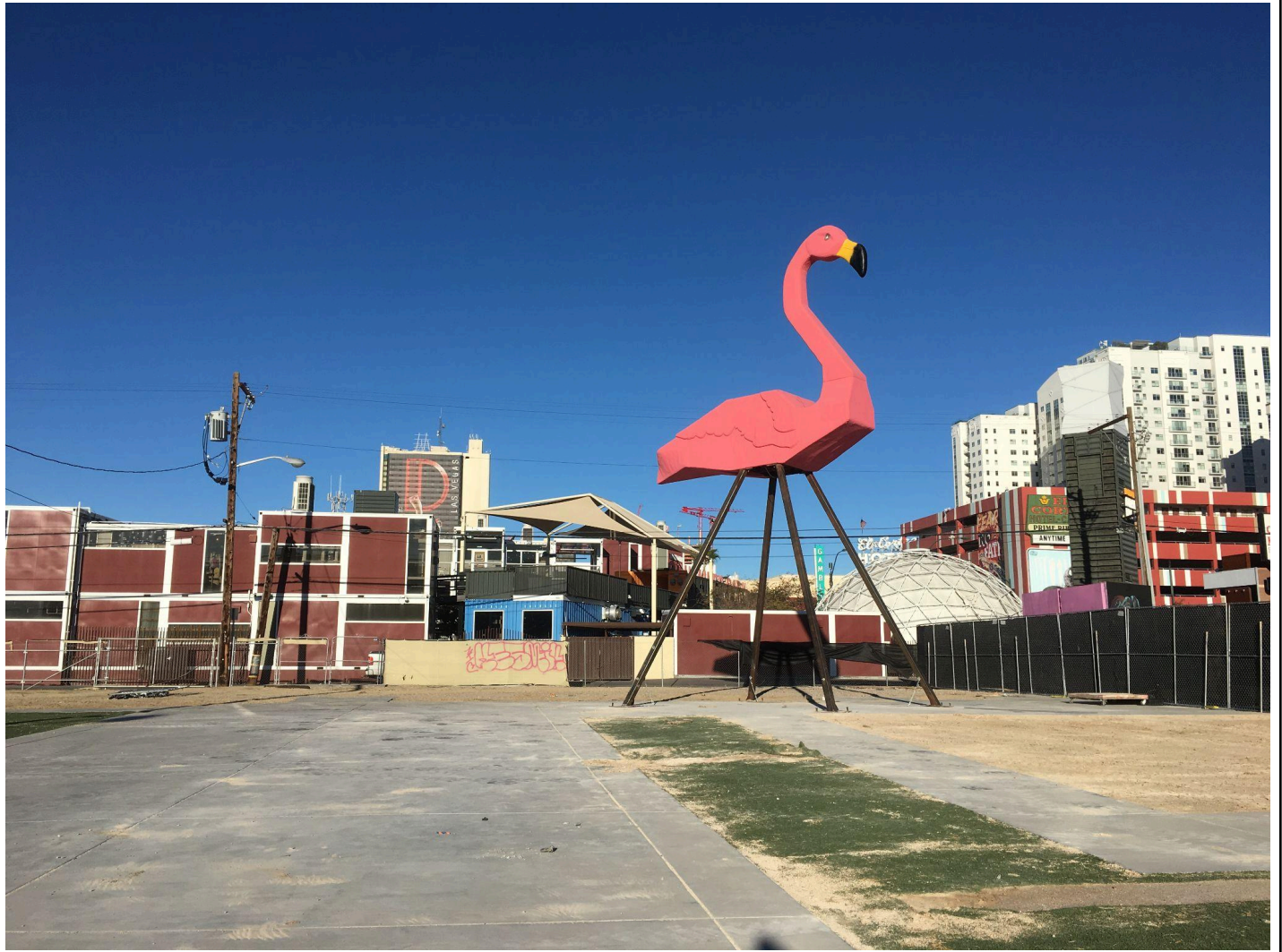
"Phoenicopterus Rex" Steel, Fiberglass, Paint. 20'20'x40' $40,000 August 2017 Las Vegas NV (Shown 2020)