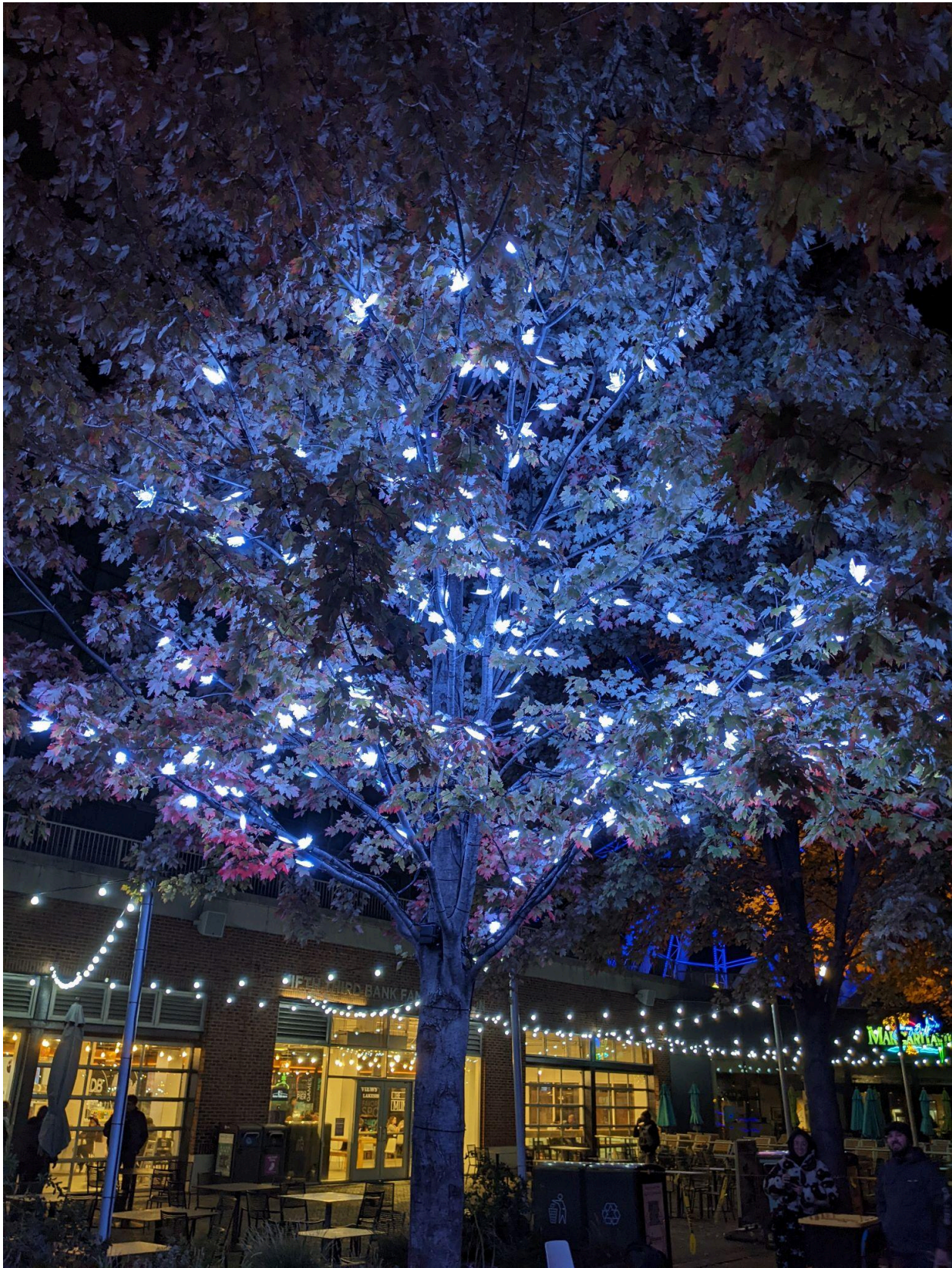
"Navy Pier ArborLights" Cast Polycarbonate, LEDs. Installed in a Marmo Maple $50,000 September 2022 - Chicago, IL