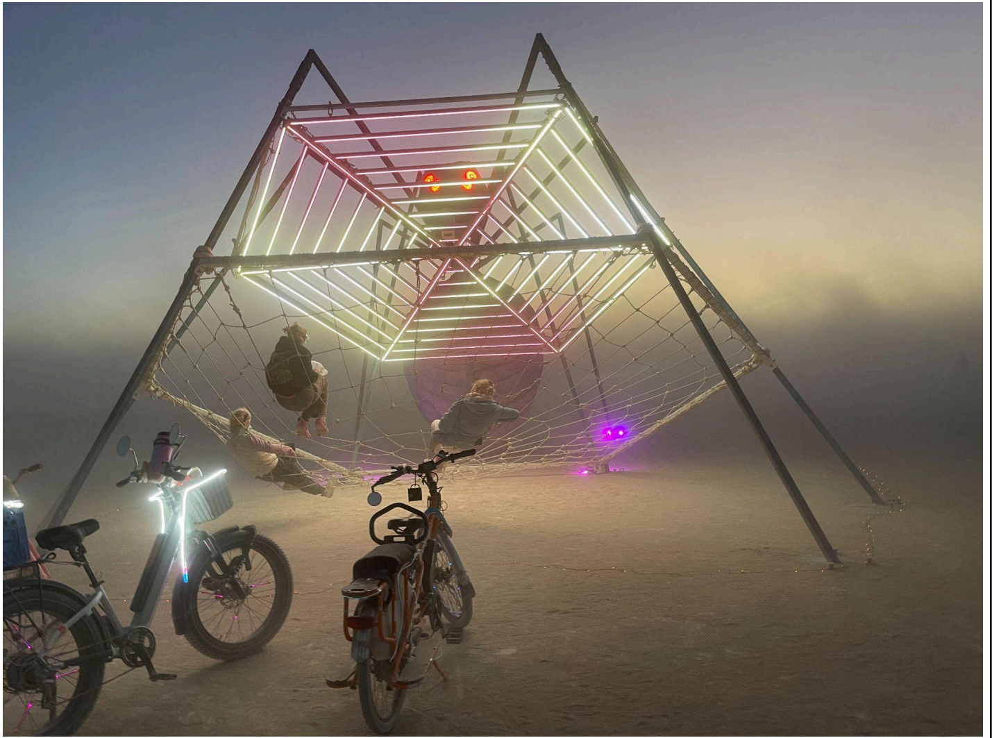
"Spider Trap" Steel, LEDs, Rope, Paint. 20'x30'x40' $30,000 August 2023 Black Rock City, NV