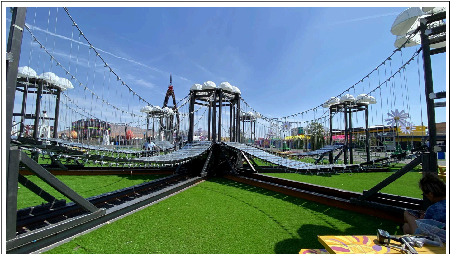
"Wander Bloom" Steel, Electronics. 100'x100'x16' $80,000 May 2022 Las Vegas, NV