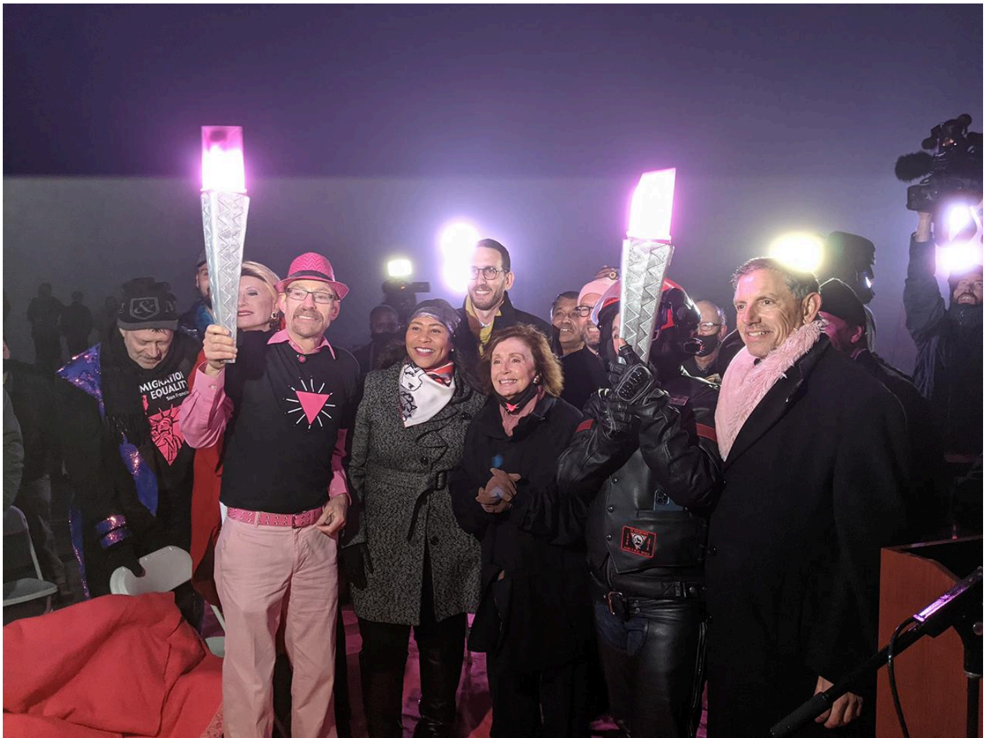
"Pink Torch" Urethane, LEDs, Cast Aluminum San Francisco, CA 2020