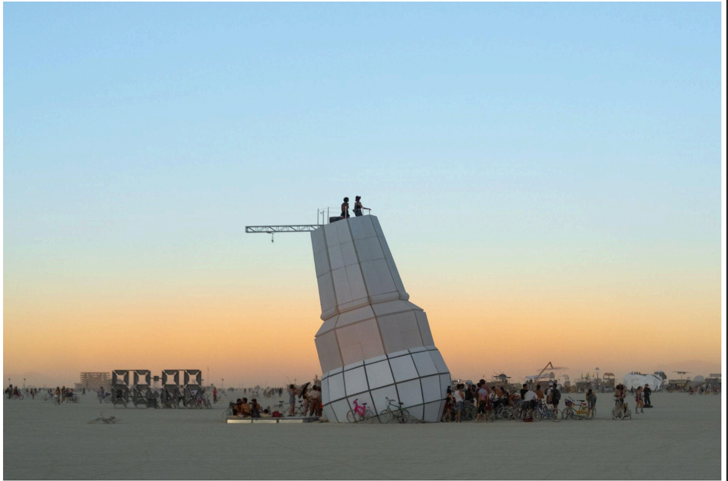
"Cone Down" Steel, LEDs, Plastic 30'x30'x20' $30,000 August 2019 Black Rock City, NV