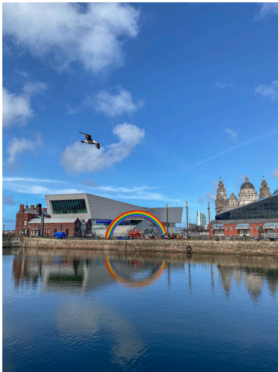
"Rainbow Bridge" Steel, LEDs, Wood, Paint.