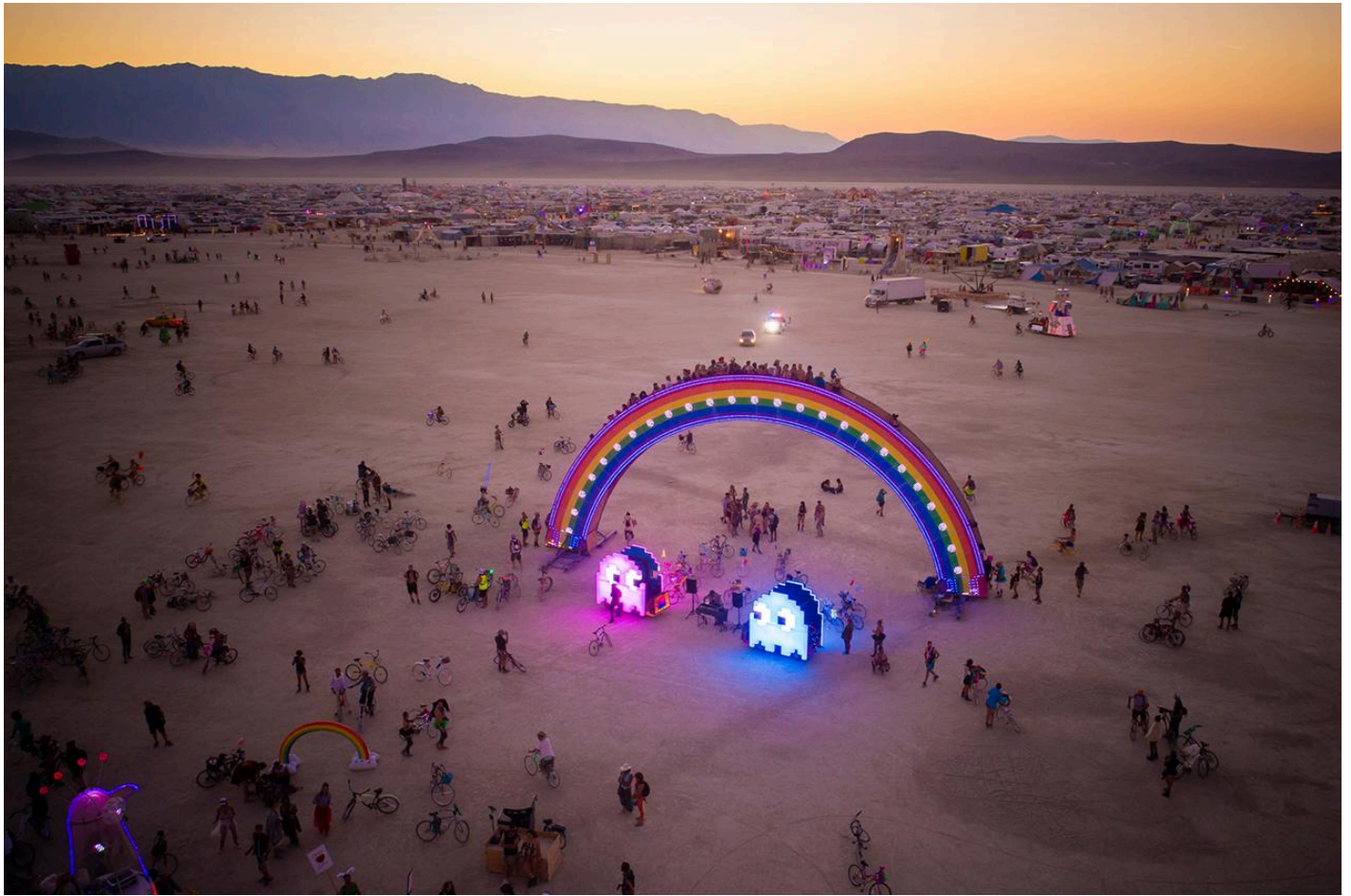
"Rainbow Bridge" Steel, LEDs, Wood, Paint. 75'x31'x4' $250,000 August 2018 Black Rock City