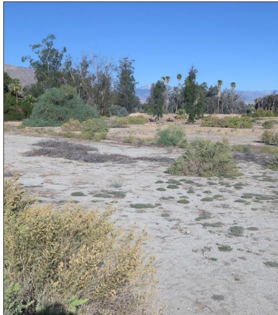
Figure 6. View across site to northwest.