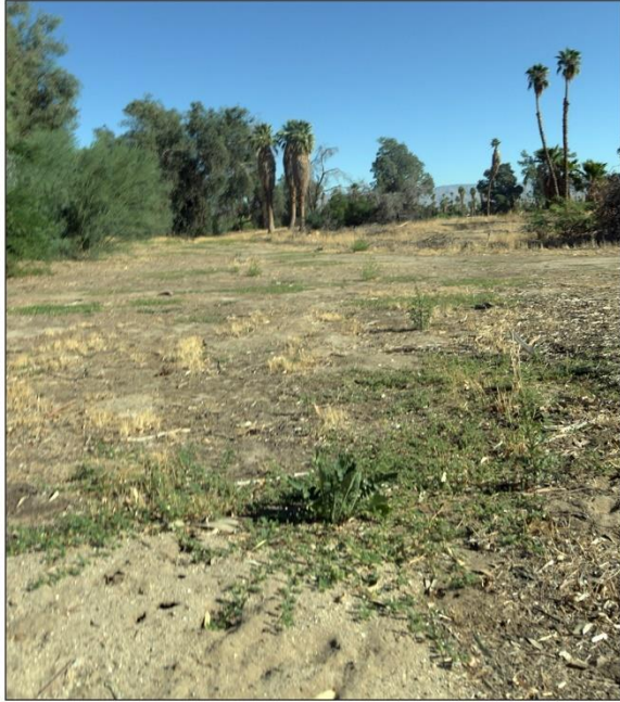
Figure 4. View across site to northeast.