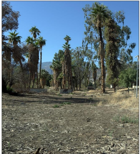
Figure 7. View across site to southwest.